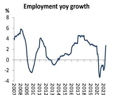
Figure 3. Average employment (y/y growth)