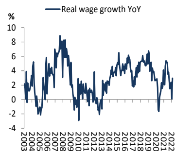
Figure 3: Real wage growth (y/y change)